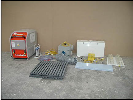
Other parts, including Water Management System, filters, Negative Pressure Unit, locker/seat, heaters, mats etc.