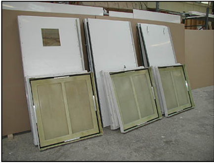
Fibreglass parts for a 3 stage Multisystem.