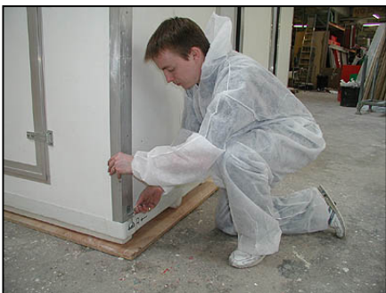
.....and secure with the over-centre clips provided.