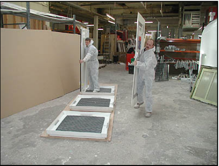
Lay out the bases roughly in position and prepare for assembly of the walls.