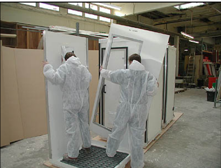
On each module in turn, slot the wall panels into the channel around the outer edge of the base.....